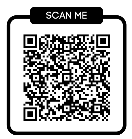
24-25 MEMBERSHIP YEAR WRAP-UP FORM

As you may be aware, the NJCAAE is a membership driven association. The following form is a great way for you to share your input to help the association continue improving so that we can better serve you, students, participants, and your fellow members!