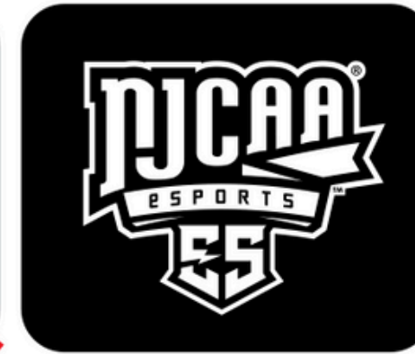
ON DARK COLOR