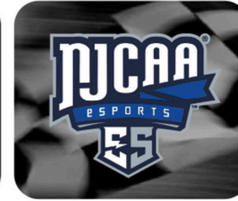
ON COMPLEX BACKGROUND