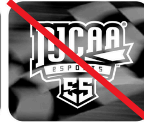
ON COMPLEX BACKGROUND