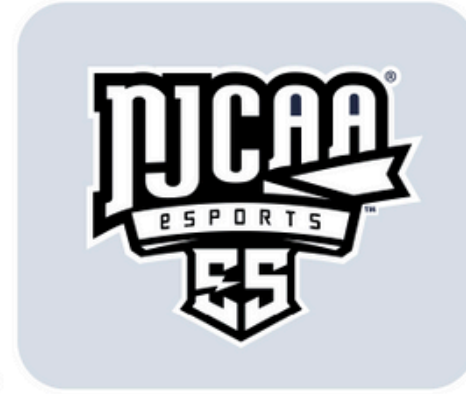
ON NJCAA GRAY/ LIGHT COLOR