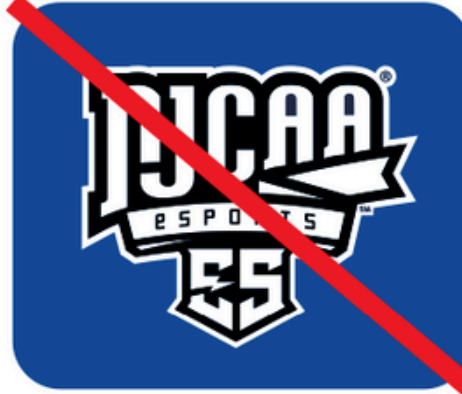
ON NJCAA BLUE