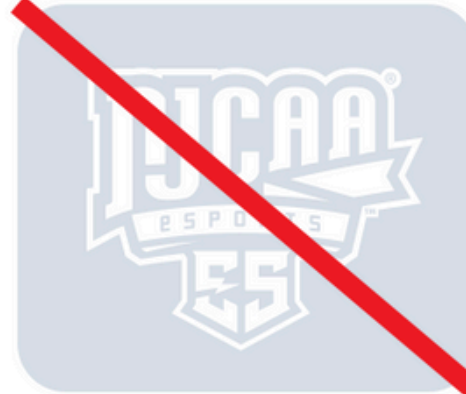
ON NJCAA GRAY/ LIGHT COLOR