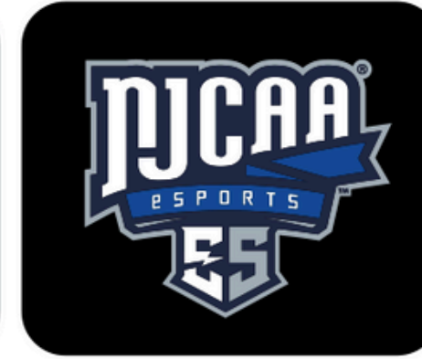
ON DARK COLOR