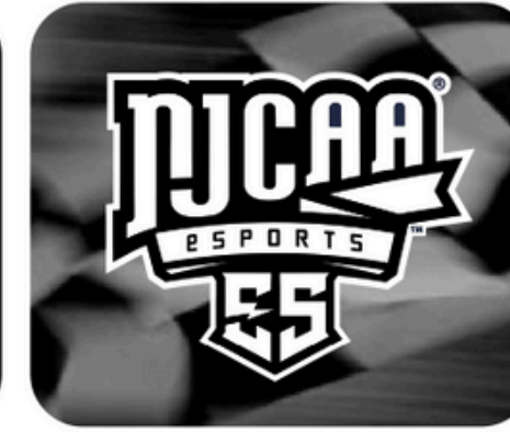
ON COMPLEX BACKGROUND